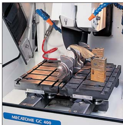
Inside view of the table.

Width: 850 mm Depth: 1520 mm Height: 1870 mm Weight: 650 kg.